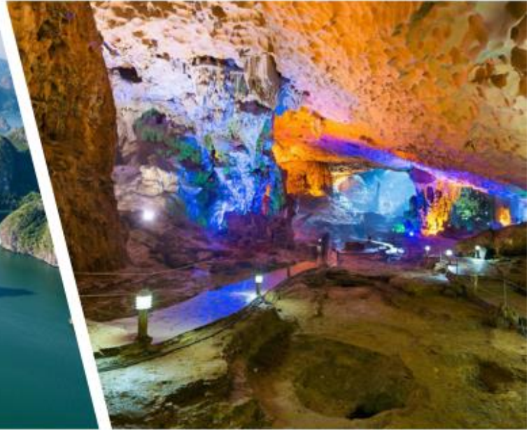
Thien Cung cave

Enjoy Water Puppet Performance – the unique form of Vietnamese art derived from wet rice civilization of South East Asia.