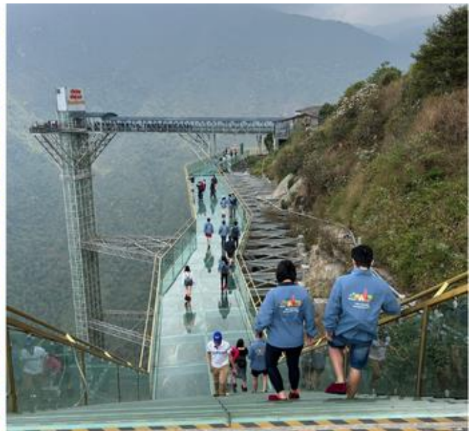
Rong May glass bridge

After taking scenery then get cable car back to Sapa.