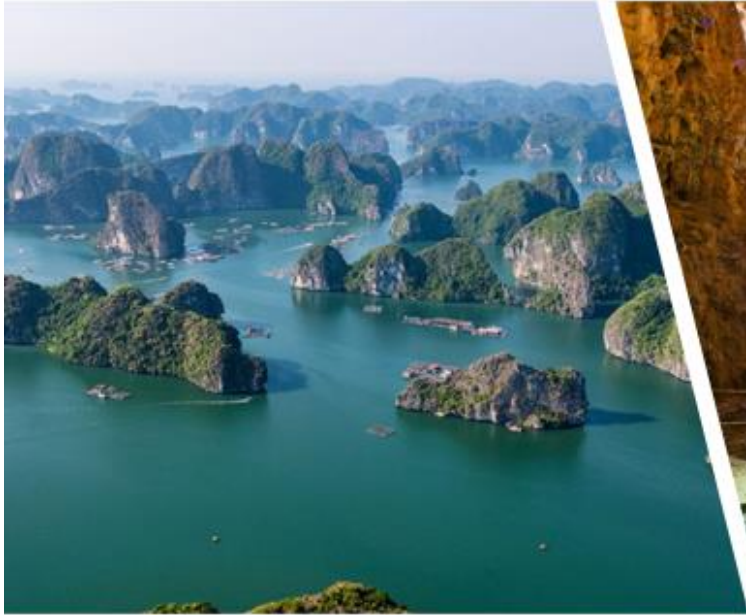
The overview of Ha Long Bay