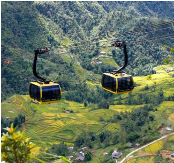
Fansipan Cable Car

As you know the cable car in Sapa is the world's longest and highest cable car, running up from sleepy Sapa Town in Lao Cai Province to the peak of 3,143-meter Fansipan Mountain, known as Indochina's rooftop. Enjoy the view from the highest point of this incredible mountain. The lush green and subtropical vegetation makes this mountain really very beautiful. Take some pictures for unforgettable experience from the top.