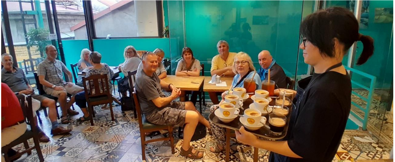
Hanoi Egg Coffee – Only In Vietnam