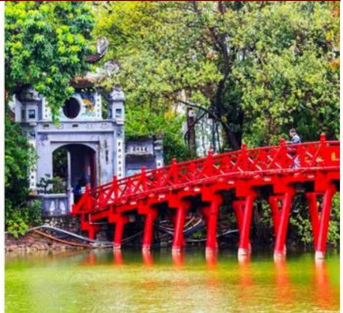
Hoan Kiem Lake

Upon arrival at Noi Bai International airport, meet up our representative and proceed to centre for sightseeing at Tran Quoc Pagoda, Hoan Kiem Lake, Hanoi Opera, 36 Ancient Street and free shopping at Dong Xuan market, Hang Gai, Hang Dao, Hang Ngang ...ect with hundreds of specialty shops selling silk clothing, lacquerware, embroidered linens, furniture, bamboo, cooking utensils... Enjoy a local egg coffee (a special Hanoi coffee)