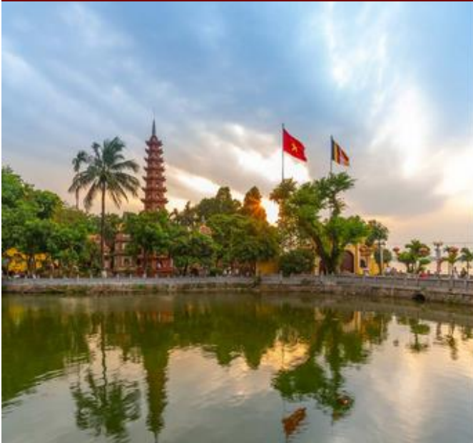
Tran Quoc Pagoda