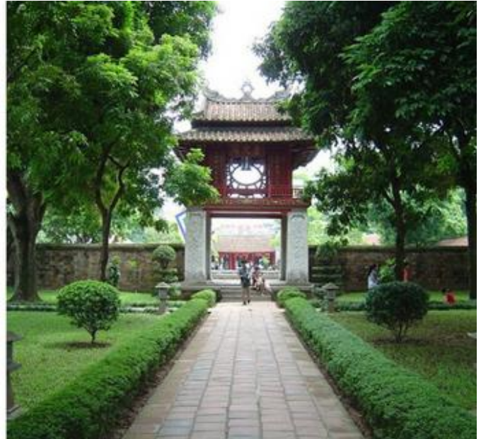
Temple of Literature

After lunch, transfer to Halong. Arrival Halong, check in hotel, the rest of day is at your own leisure.